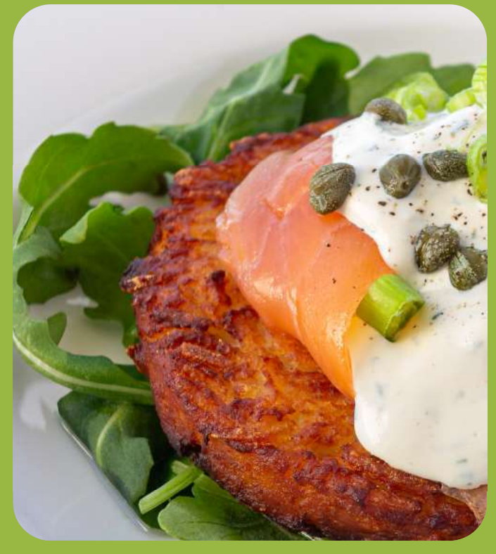
Potato Rosti topped with smoked salmon and sour cream - makes the perfect canape or breakfast menu item.