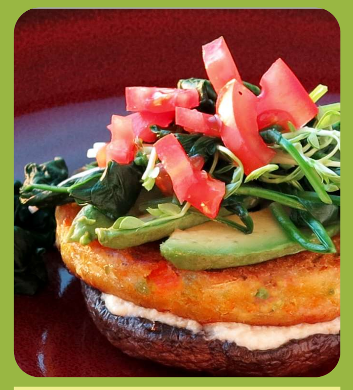
Gluten Free Burger Pattie served with mushroom, avocado, spinach and tomato - makes a nutritious breakfast menu item.